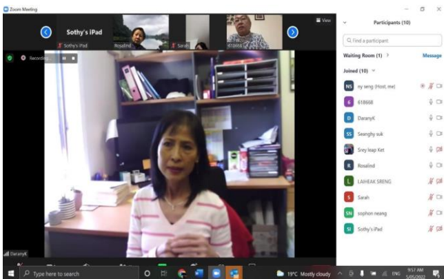
Women and Counselling Services Information Session