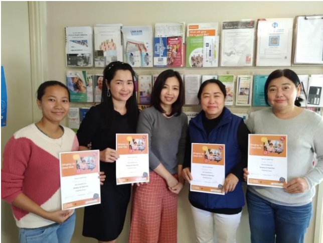
Bringing up Great Kids Workshop