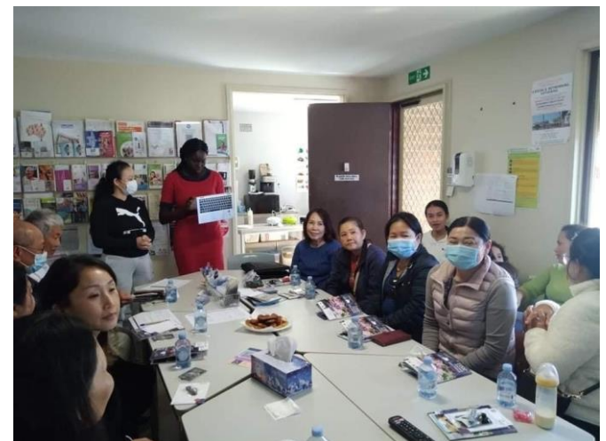
Saver Plus Information Session