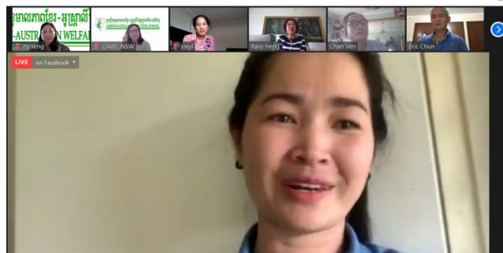
Healthy Relationship Workshop via Zoom