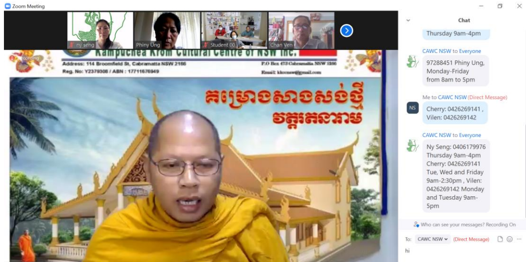
DV Group Community Leaders Zoom