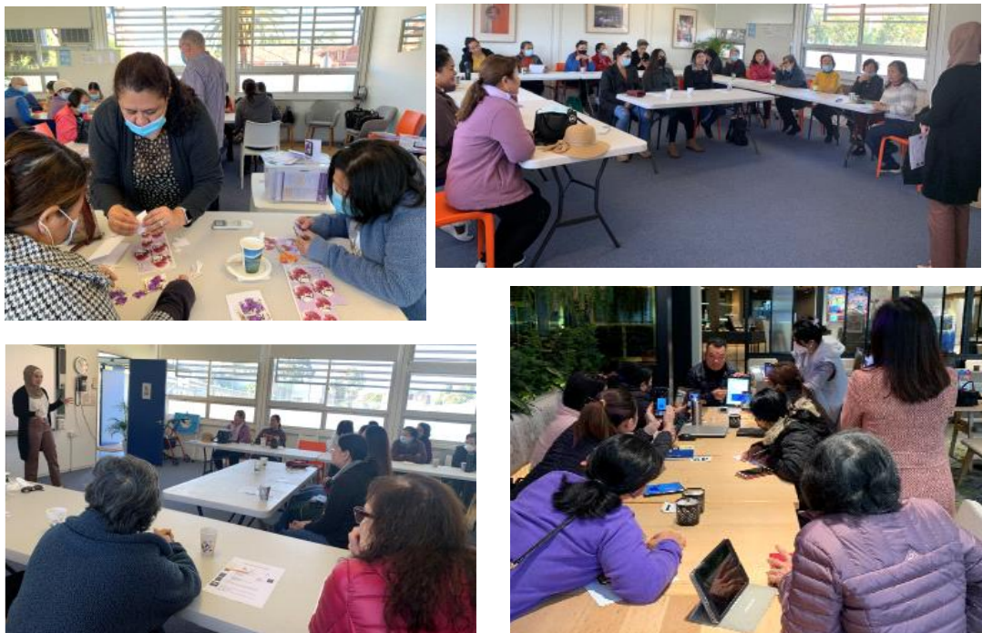
DV Education Activities