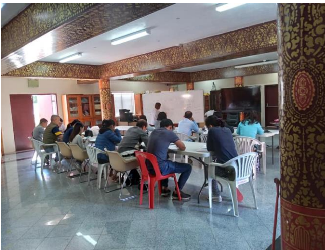
Saturday English Class