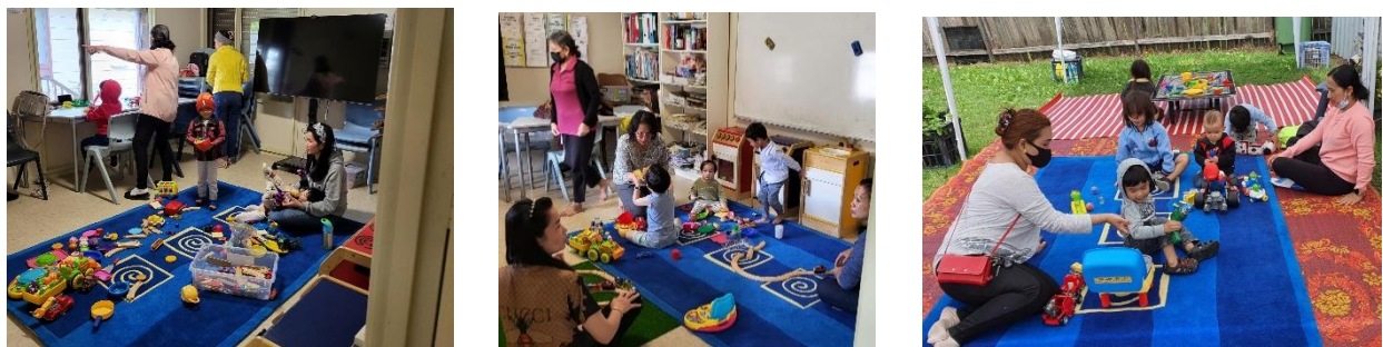
Out door and in door play group