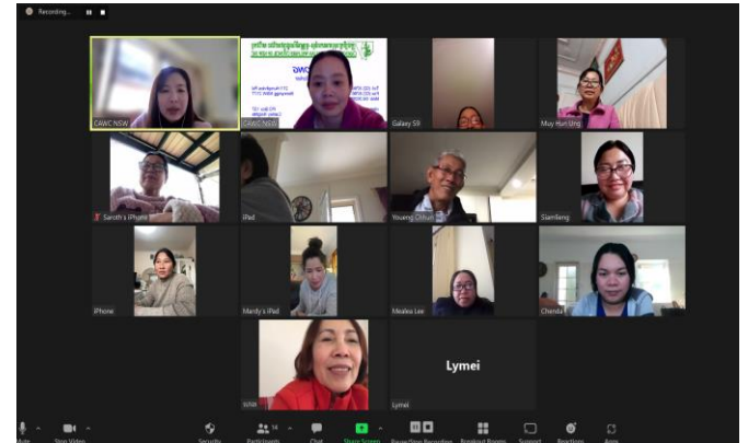
Social Meetup over Zoom