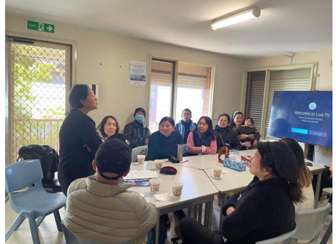
Police Information Session